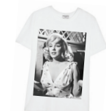
Team Monroe The Seven Year Itch , December 13; The Misfits , January 7