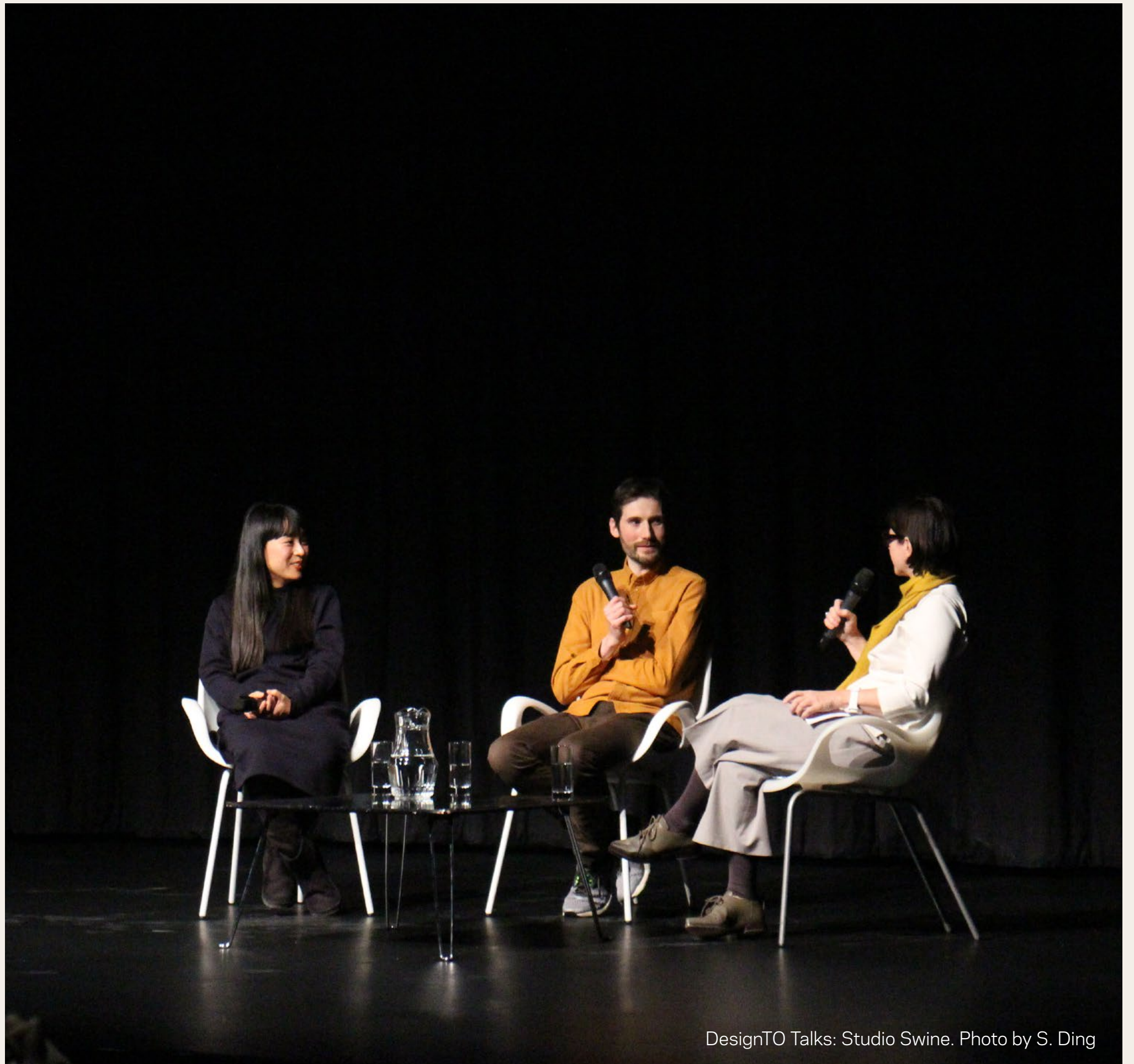
DesignTO Talks: Studio Swine.