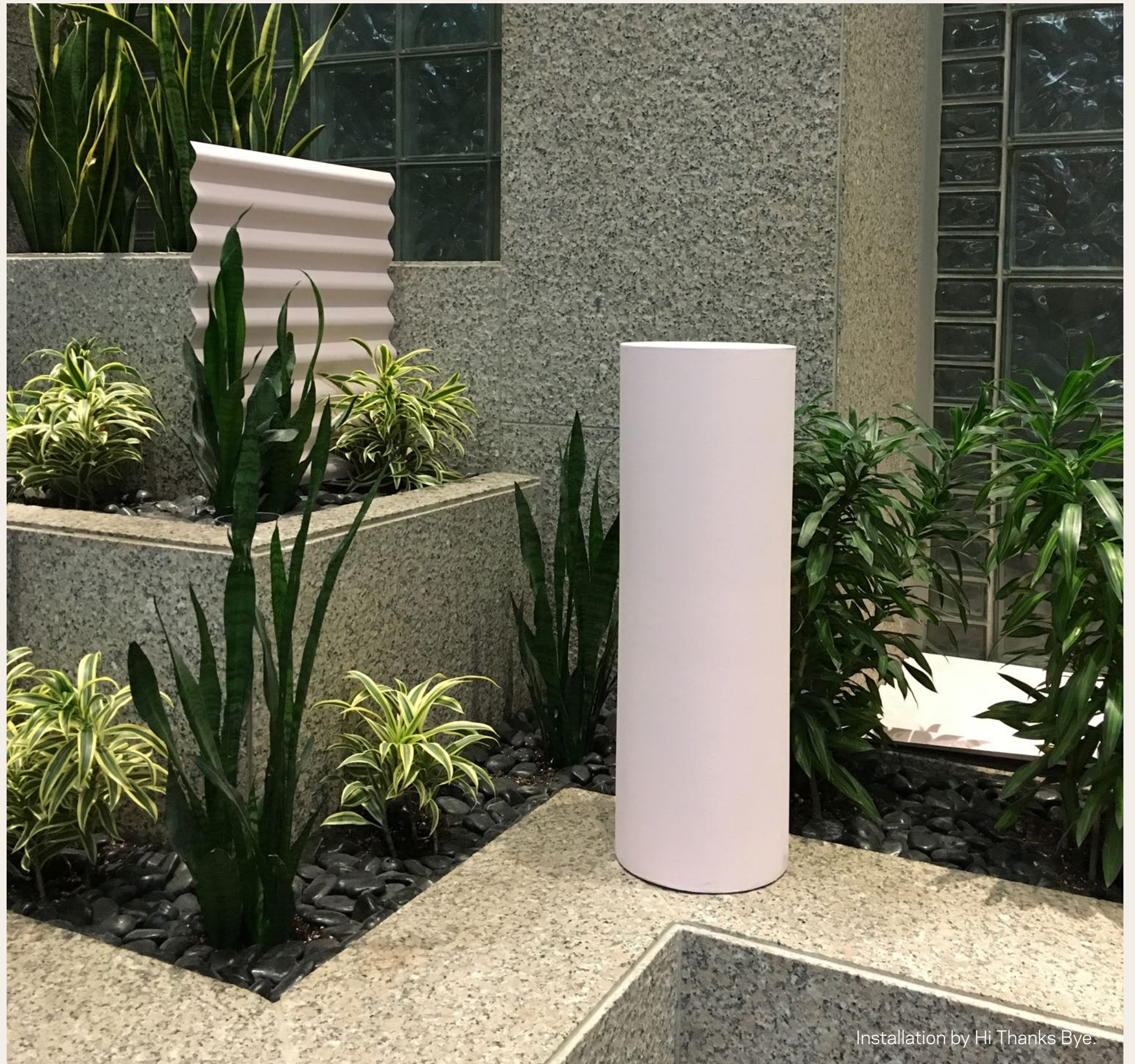
Installation by Hi Thanks Bye.