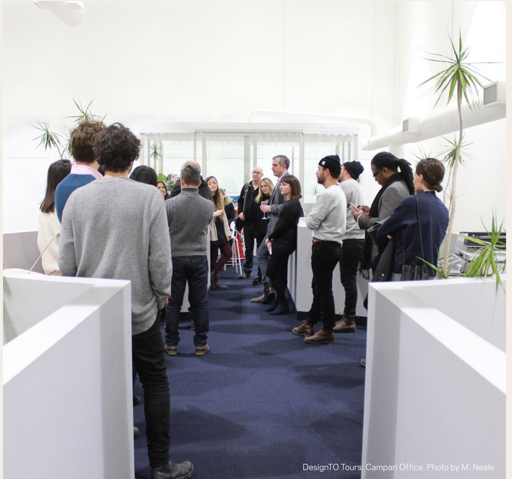
DesignTO Tours: Campari Office.