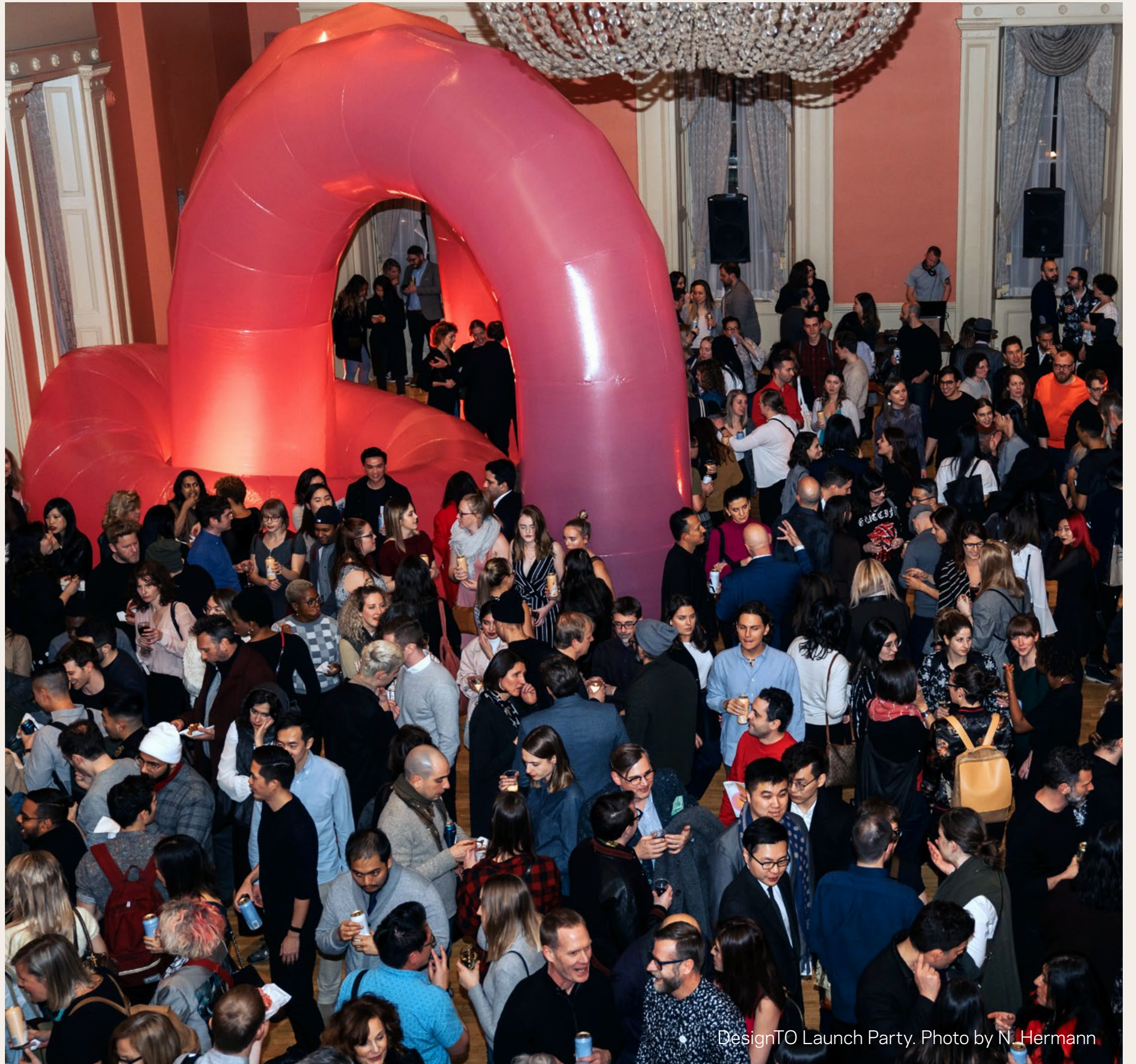
DesignTO Launch Party.