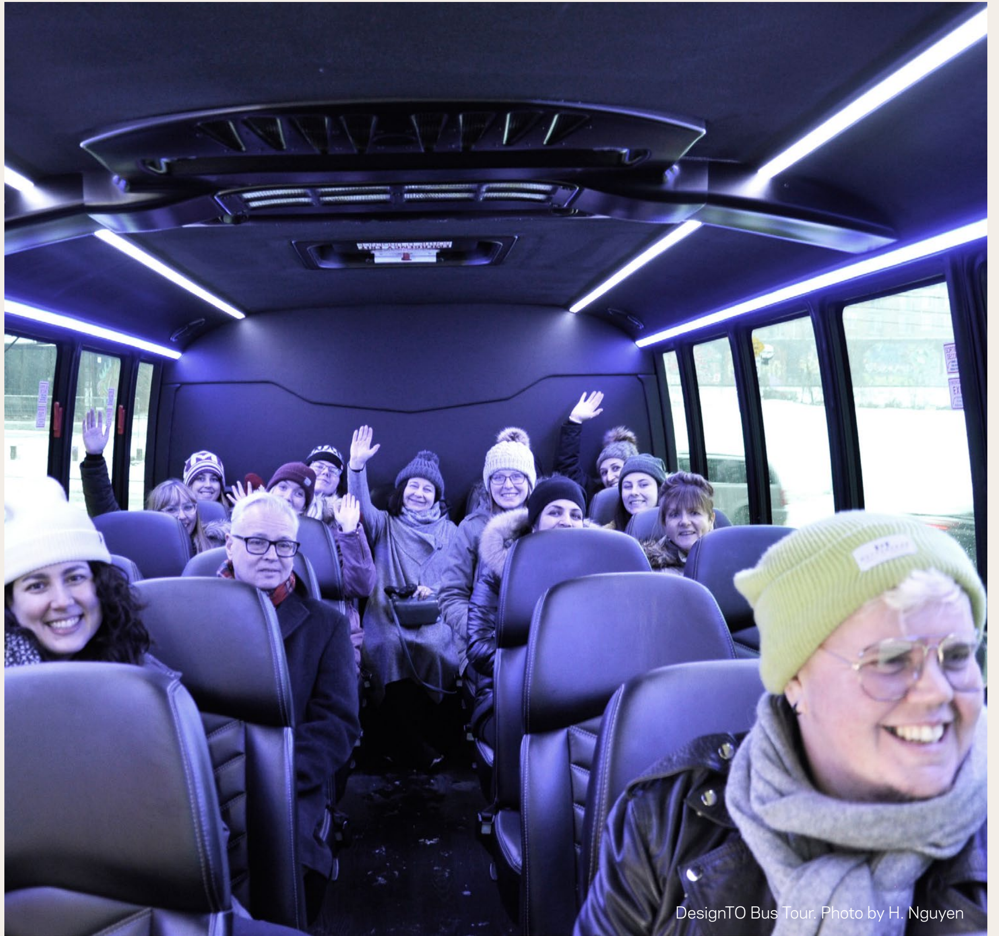
DesignTO Bus Tour.