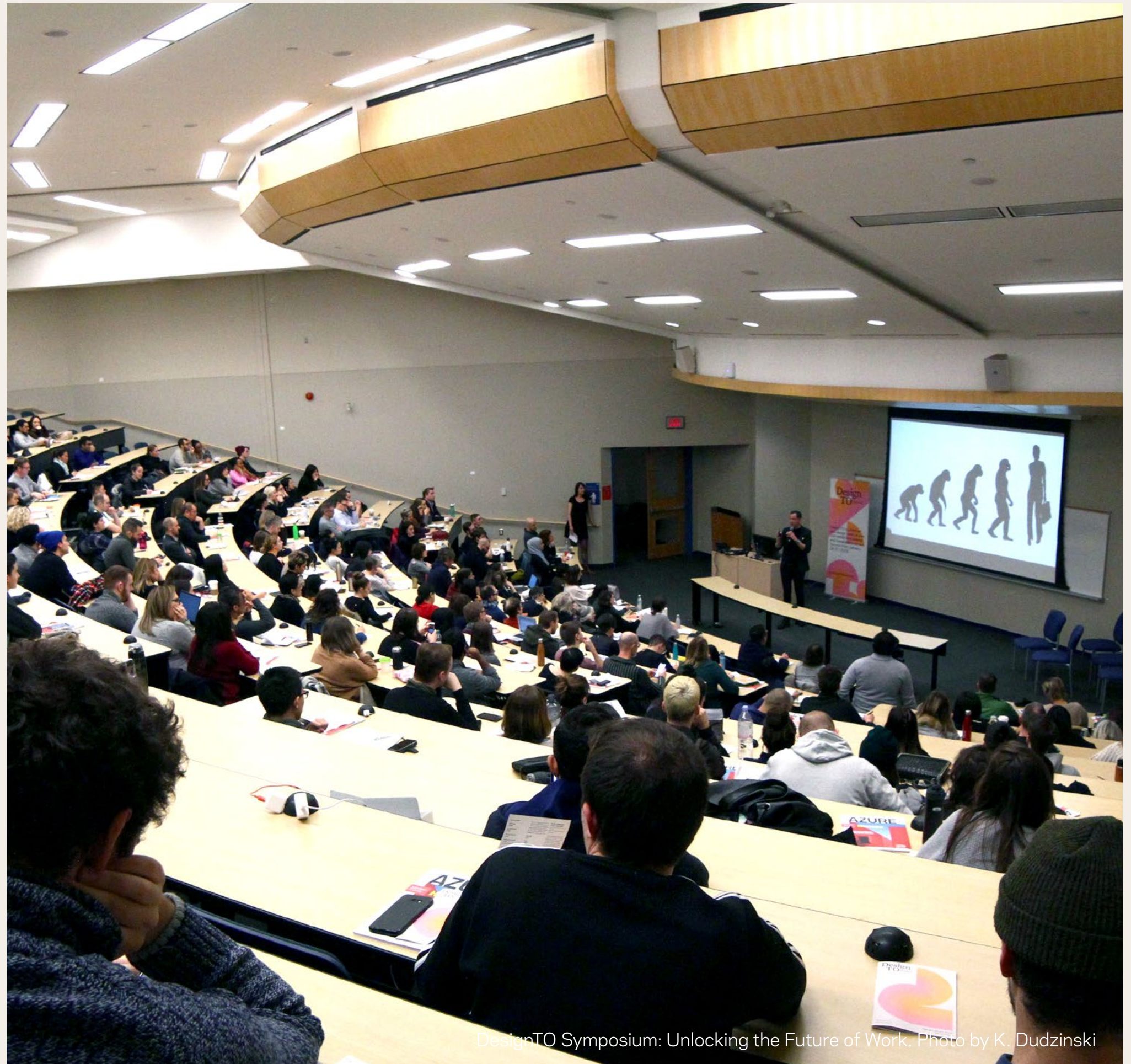
DesignTO Symposium: Unlocking the Future of Work.