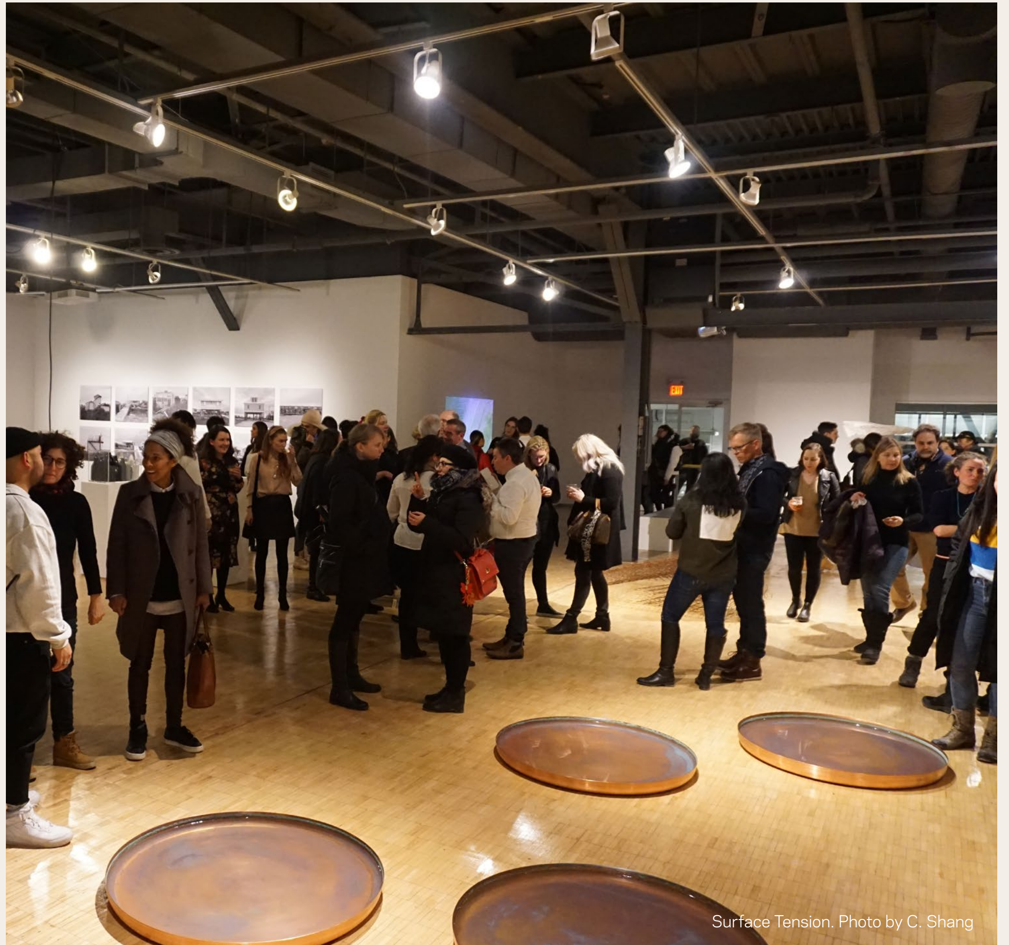
Surface Tension.