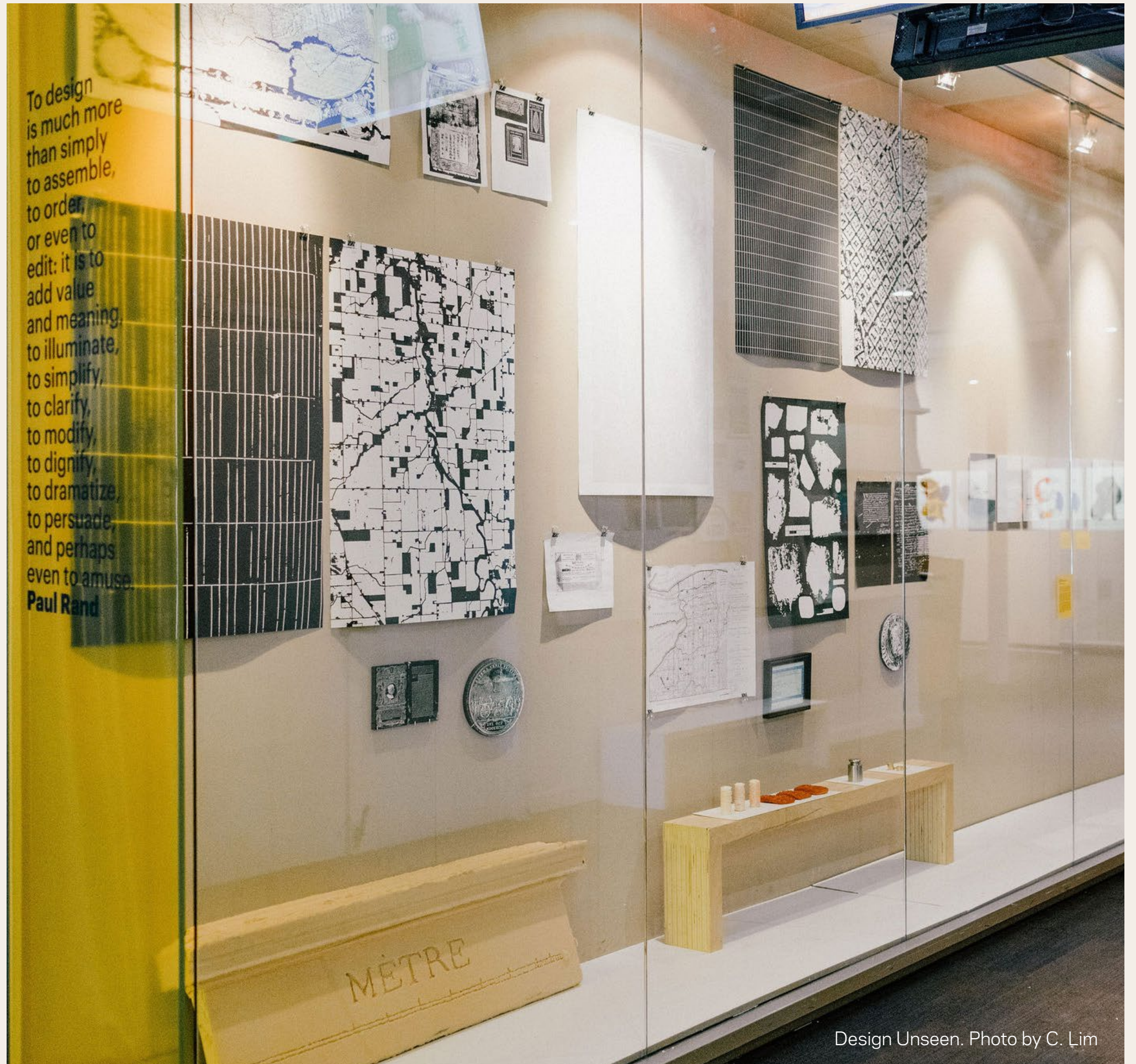
Design Unseen.