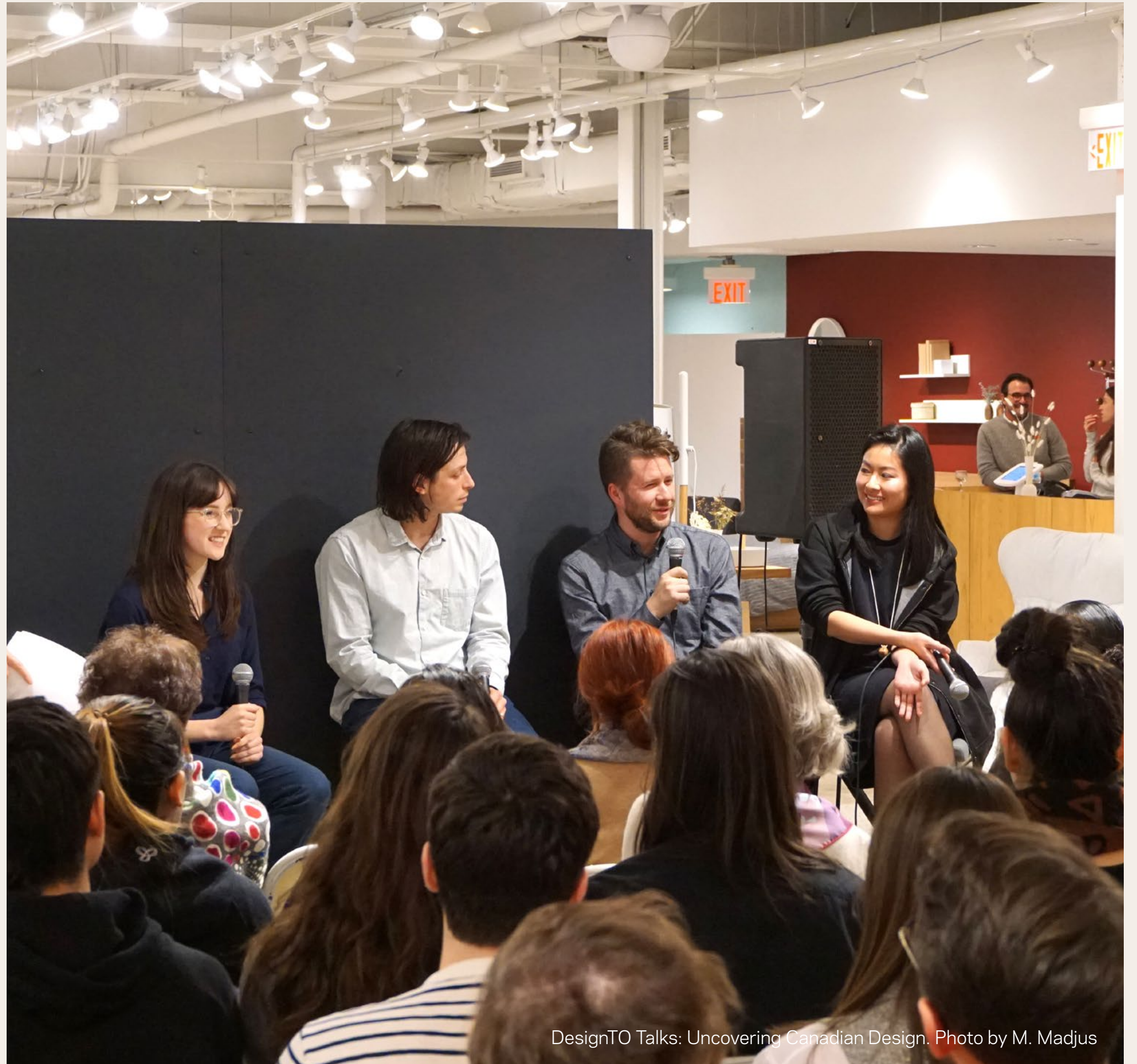
DesignTO Talks: Uncovering Canadian Design. Photo by M. Madjus